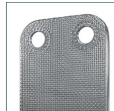
Innovative micro plate design