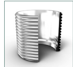
Flexible two-in-one connection