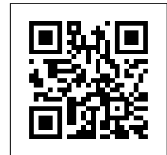
Scan QR code for more technical information and code numbers